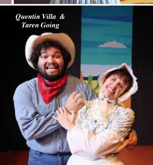
Ripples - December - 2023 — Page 2