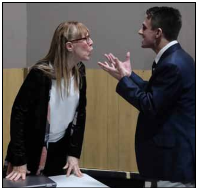
Mother and son at odds over what is “right” and what is “fair.”