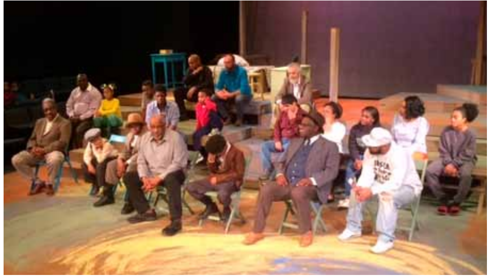
Book Author, Christopher Paul Curtis joined the cast for a talkback after the April 20 performance. Cast and audience alike were charmed and grateful for his insights.